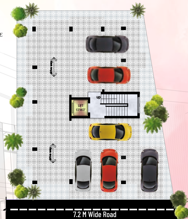
SITE CUM STILT FLOOR PLAN